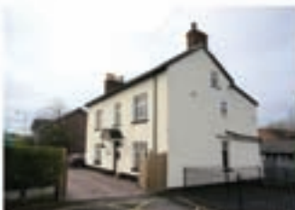
Boothshill Road, Lymm £1950 - 5 Bedrooms