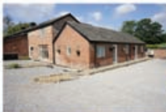
Pool Farm - Commercial From £7600 to £18,400 annual Rent

Open 7 days a week with evening viewings available