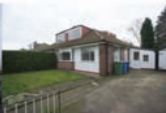
Albany Road, Lymm £795 - 3 Bedrooms