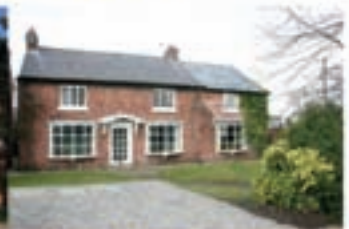
Rose Cottage, Lymm £1350 - 4 Bedrooms