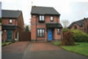
Claydon Gardens, Rixton £735 - 3 bedrooms