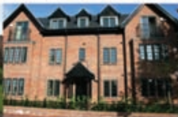
Mayfield Court, Lymm £850 - 2 Bedrooms