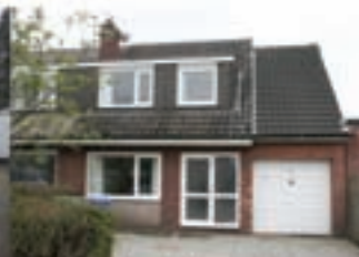
St Peters Close, Lymm £850 - 4 Bedrooms