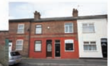
Earl Street, Warrington £495 - 2 Bedrooms

Telephone 01925 599111 / 14a Warburton House, Eagle Brow, Lymm, Cheshire WA13 0LJ admin@bridgewaterlettings.co.uk / www.bridgewaterlettings.co.uk