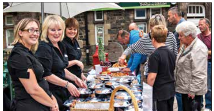
Statham Lodge presented Cream Teas