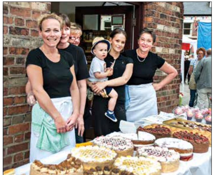
Sexton's Bakery with their display of cakes