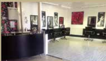
GAIL'S HAIR STUDIO

Come in and discover your perfect wardrobe this season with stockists including Fransa, B-Young and Cream. From beautiful clothes and shoes to bags and jewellery you will be sure to walk away with something that little bit different to the highstreet. T: 01606 889192 Open late night Thursdays until 7pm