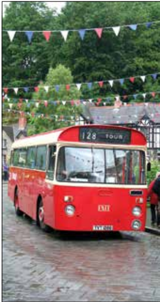
A selection of pictures from the Historic Transport Day.

Visitors to the event included local TV celebrity Matthew Corbett, who had the honour of being patron of the Historic Transport Show and infamous pirate Jack Sparrow (pictured right) who could be seen on the banks of the Bridgewater Canal plying his trade!