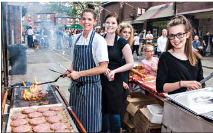
Barbecue at Hopkinson's Butchers