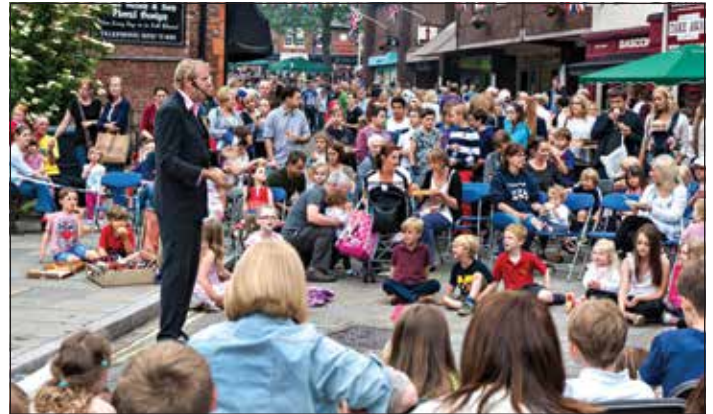
Entertainment at the popular Foodfest