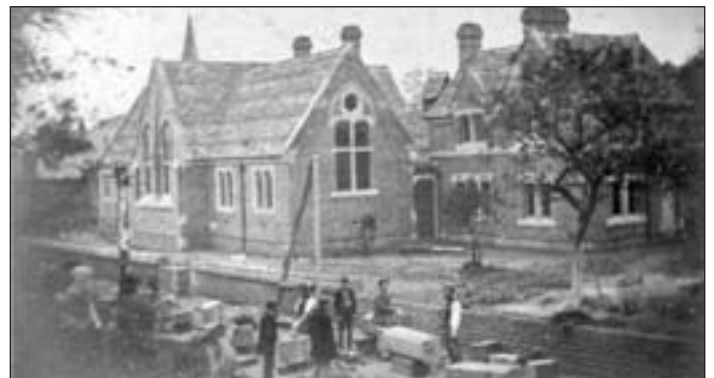
Pepper Street School