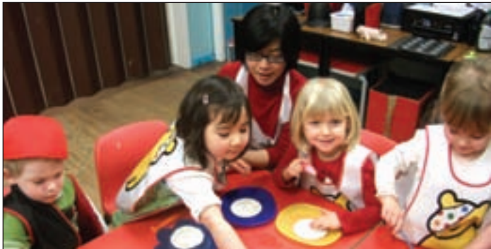
The picture shows a group making some yummy Chinese dumplings.

The children had lots of fun together dancing the "dragon dance" and attempting to eat their noodles with chop sticks!