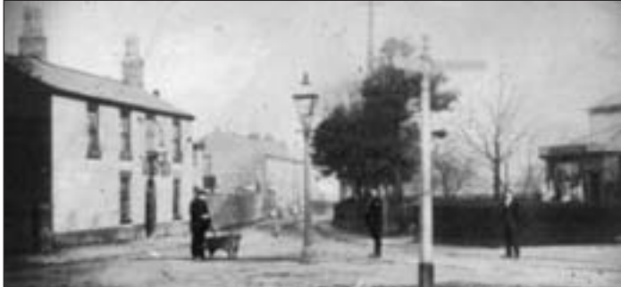
The Green Dragon