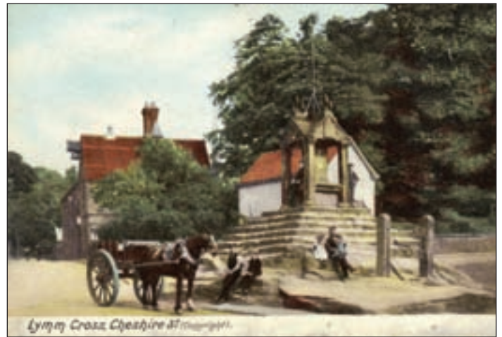
Lymm Cross, Cheshire at 1800-1850