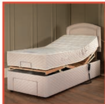
PRISCILLA ADJUSTABLE BED