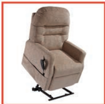
LILBURN RISE & RECLINE CHAIR