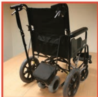
WHEELCHAIR POWER PACK WITH FREE WHEELCHAIR