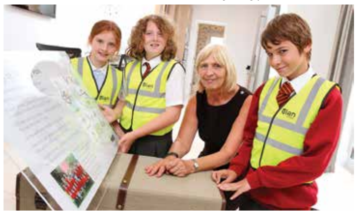
Children from St Lewis Primary enjoy a first look at the finished information boards at Gosling Park

safe near construction sites." The information boards produced by the children are currently on display at Gosling Park. When all of the homes are complete they will be given pride of place at the start of a pathway that will run through the woodland and wildflower meadow. The show home at Gosling Park is open Thursday to Monday from 10am to 5pm, call 0845 293 8818 or see www.elan-homes. co.uk/aosling-park. co.uk/gosling-park.