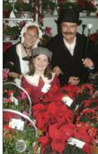
Victorian family at last year's event