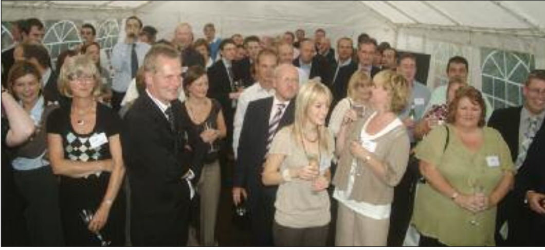
Guests at the party celebrating the refurbishment.