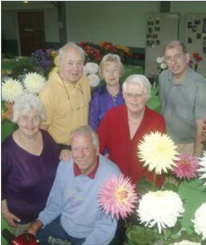
Members with some of the award winning entries.

CULCHETH and District Horticultural Society held their 57th autumn show at Newchurch Parish Hall.