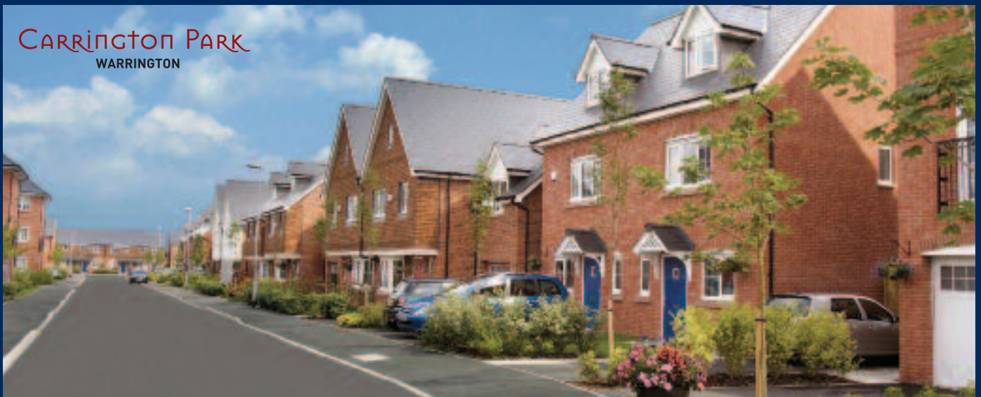
CARRINGTON PARK WARRINGTON

We are so confident with the quality of our homes, that we will guarantee their future re-sale value for 5 years †