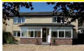
Mustard Lane, Croft

Detached cottage, four bedrooms, three reception rooms, kitchen diner, rural views, unfurnished. £995 pcm