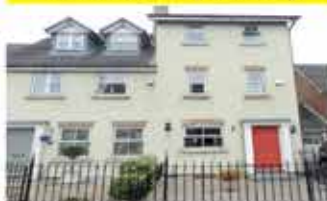
Millbrook Close, Glazebury

Four bedroom 3 storey town house, lounge, study, breakfast kitchen, driveway parking, enclosed rear garden. £215,000