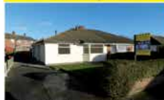
Thames Road, Culcheth

Fully refurbished semi-detached bungalow, three bedrooms, open plan lounge/diner/kitchen, recently turfed front and rear garden, driveway parking. £159,950