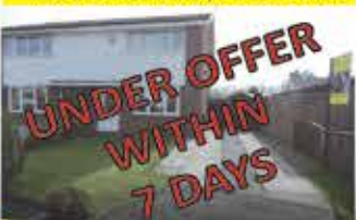
Woodhouse Close, Gorse Covert

Semi-detached house, two bedrooms, lounge, kitchen diner, private rear garden, off road parking. £124,950