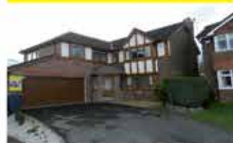
Doeford Close, Culcheth

Extended detached property, four bedrooms with two en-suites, lounge, study, conservatory, stunning views over farmland £429,950