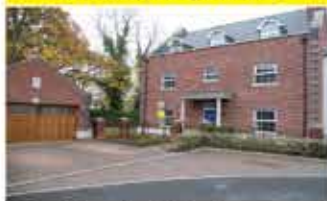
Swinhoe Place, Culcheth

Semi-detached six bedroom property, two reception rooms, kitchen diner, double garage, unfurnished, available now. £1600 pcm