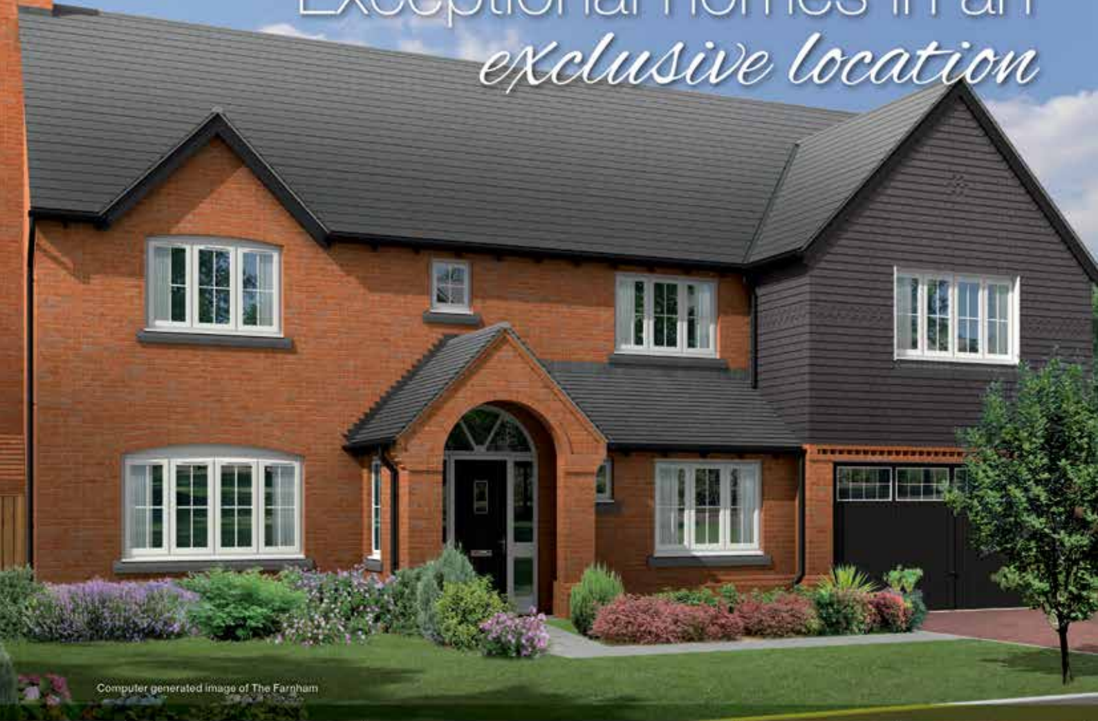
Computer generated image of The Farnham

Exceptional homes in an exclusive location