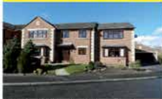
Doeford Close, Culcheth

Extended five bed detached property, three reception rooms, two en-suite bathrooms, driveway & detached garage. £425,000