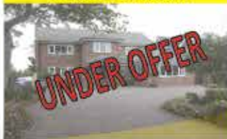
Kenyon Lane, Lowton

Detached property, four bedrooms, three reception rooms, conservatory, parking for several vehicles, NO CHAIN. £525,000