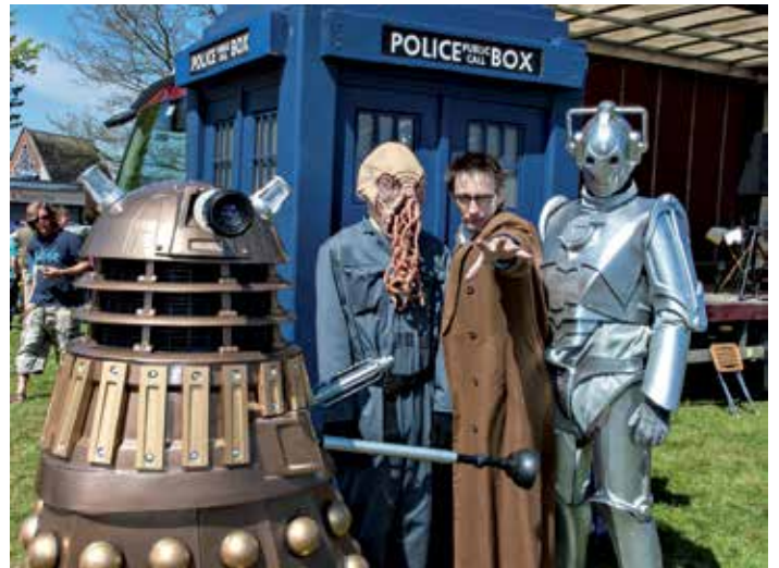
Characters from Doctor Who at last year's Culcheth Community Day

More information, including the programme from mid-day, will be posted on the Parish Council Website, www.culchethandglazebury.org.uk .