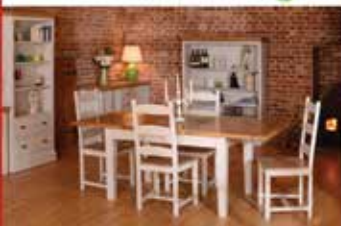
Tatton Painted Dining & Occasional