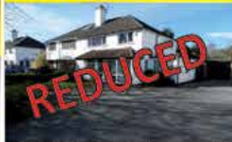
Wigshaw Lane, Culcheth

Semi detached property, three reception rooms, three bedrooms, converted loft area, landscaped gardens. NO CHAIN. £259,950