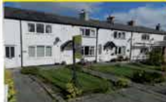
Warrington Road, Glazebury

Terraced cottage, two bedrooms, lounge, kitchen diner, family bathroom, off road parking, lawn area, courtyard to rear. £145,000