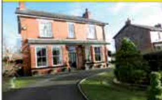
Hob Hey Lane, Culcheth

Period detached property, renovated to a high standard, four double bedrooms, three reception rooms, generous landscaped rear gardens, £665,000