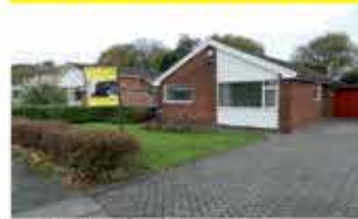
Sutton Avenue, Culcheth

Detached true bungalow, lounge, kitchen diner, two bedrooms, generous plot to rear, driveway and garage. £235,000