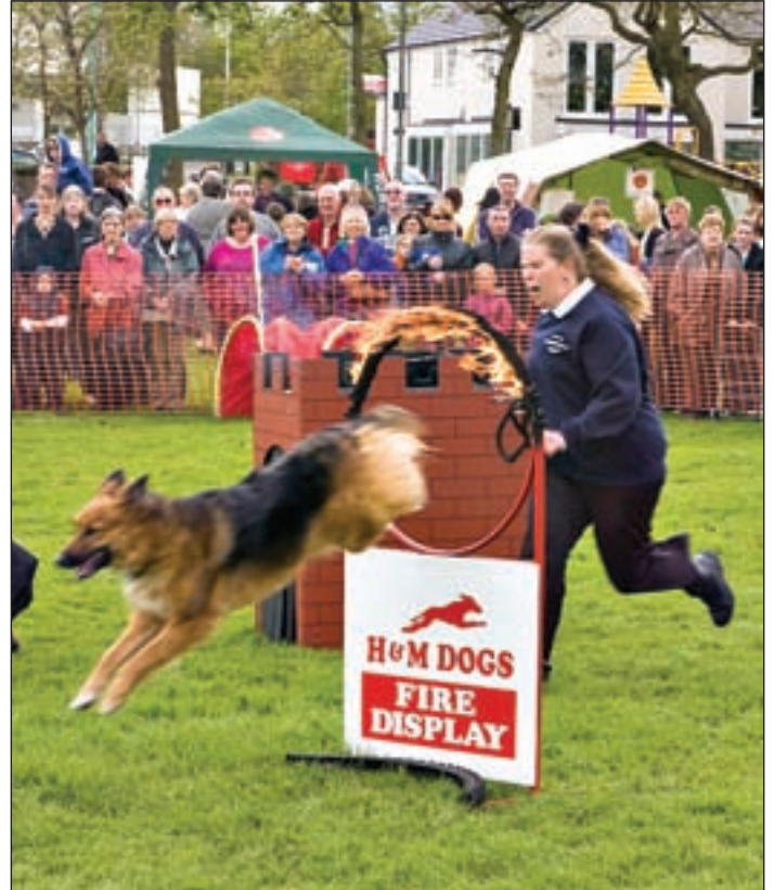
The H & M Dogs display at last year's Community Day

display by Ridgeway Falconry which will give visitors an opportunity to see magnificent birds of prey close-up, marvel at their incredible flying displays and see how the bird handlers control the birds.