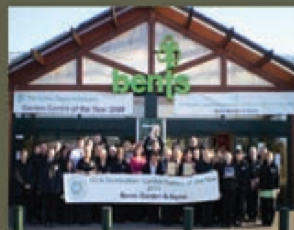
GCA Garden Centre of Excellence

It's all down to our dedicated team and our loyal customers, so to them we'd just like to say a very big thank you.