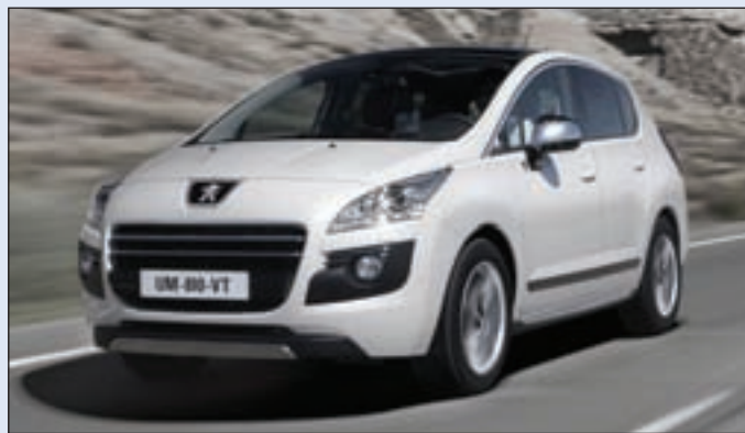
The Peugeot 3008 HYbrid4