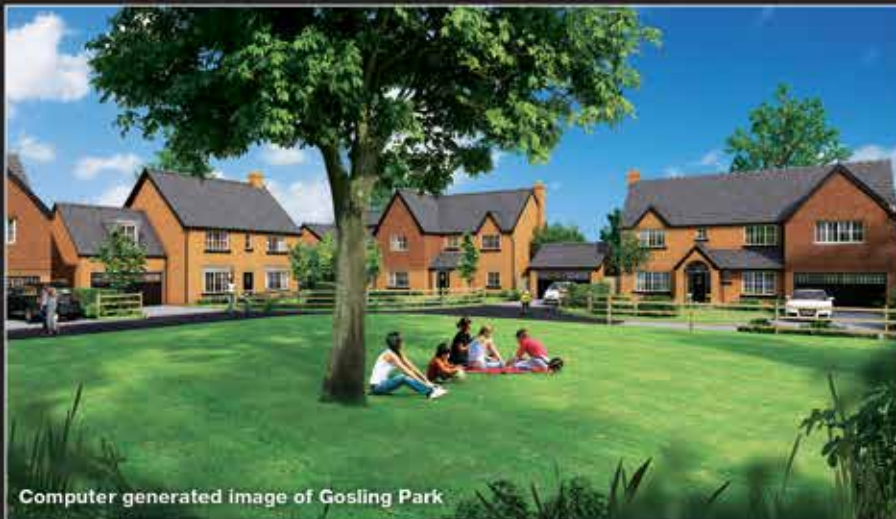
Computer generated image of Gosling Park

Gosling Park is an exclusive development in an idyllic rural location.