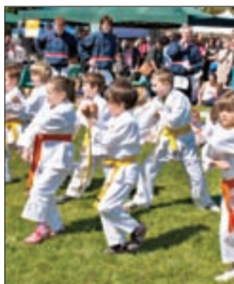
Youngsters from the North West Karate Academy Culcheth display their skills