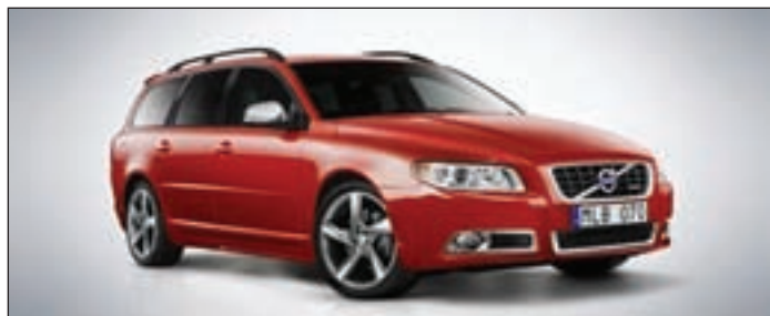
The V70 R-Design estate car

Both cars feature the latest Volvo Sensus infotainment system, all information presented on a five or seven-inch colour screen positioned to make it easy for the driver to keep his or her eyes on the road.