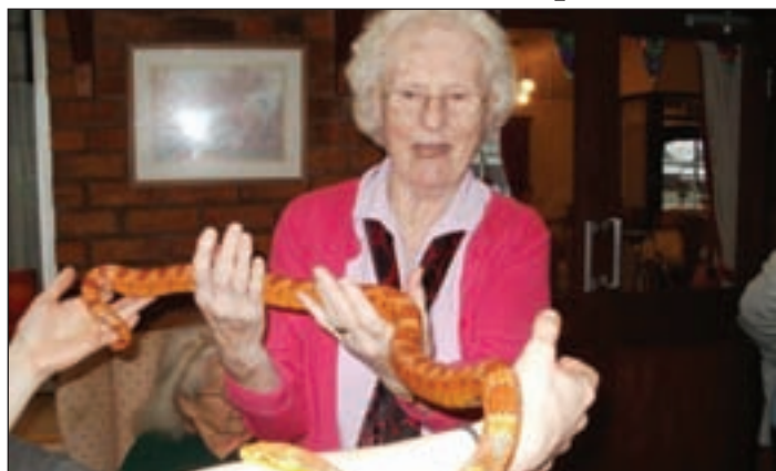
One of the residents braves handling a snake

BEARDED dragons, scorpions, snakes and raccoons were among the unusual visitors to a care home in Culcheth.