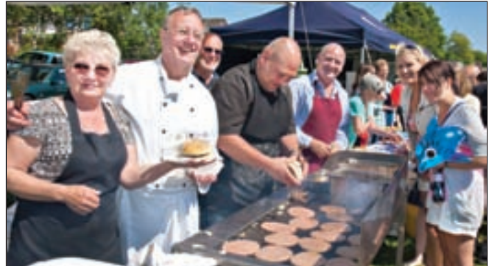
Culcheth Royal British Legion Barbecue were kept busy feeding the crowd

Attractions included Ridgeway Falconry, Tyldsley Brass Band, Trumble the Clown, Academy Karate Display, a pet show and a tug of war