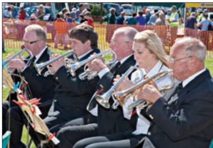
Members of the Tyldeley Brass Band provided the music