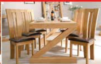
Z Range - Oak Dining & Occasional

Extensive showroom on 2 floors Over 20 stunning room sets displayed Expert advice & personal friendly service Direct delivery to your home or office