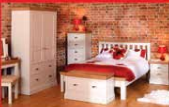
Tatton Painted Bedroom with Oak Tops