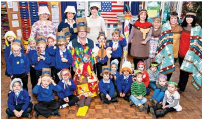
PUPILS and staff at Glazebury C of E Pre School and reception class dressed up as Pilgrims and Indians to celebrate an American Thanksgiving which included a turkey dinner for lunch.