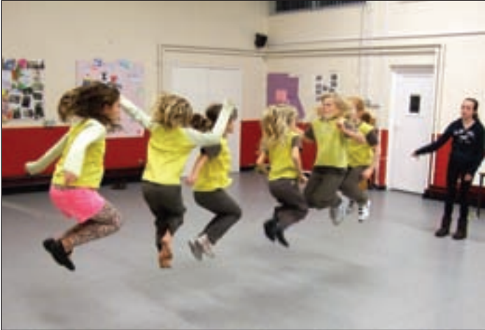
MEMBERS of the 6th Culcheth Brownies took part in a sponsored skip for the British Heart Foundation.

The Jump Rope for Heart activity was part of their work towards their Healthy Hearts badge which the girls have been working on for some time.