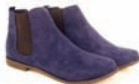
LOIS CHELSEA BOOTS 25.00

GET 25% OFF YOUR ORDER ENTER CODE CULCETH25 AT THE CHECKOUT...EASY!