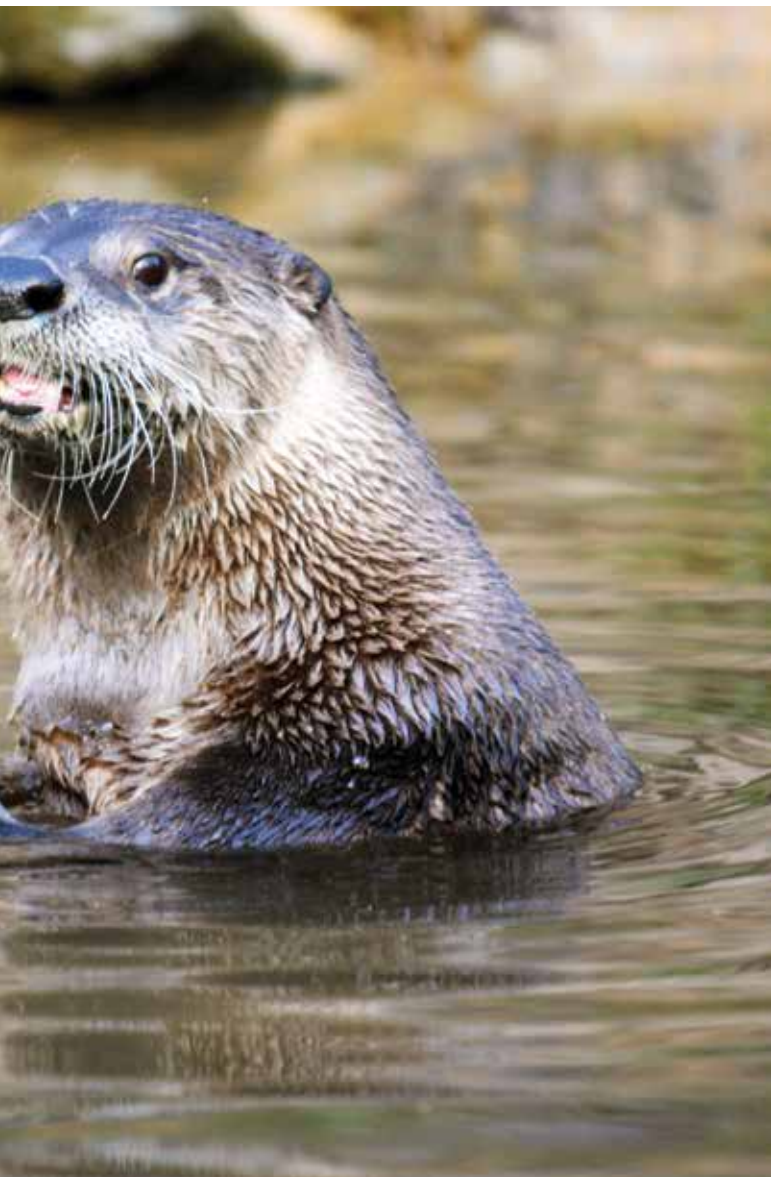
Last year's winning entry Otter and Mars Bar taken by Mark Blackledge.

an incredible response to this competition with some fantastic photographs submitted over the past few years. The growing number of entries makes shortlisting a very tricky task but also a hugely enjoyable one as the images are always so varied.