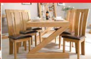
Z Range - Oak Dining & Occasional

Extensive showroom on 2 floors Over 20 stunning room sets displayed Expert advice & personal friendly service Direct delivery to your home or office