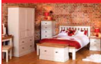
Tatton Painted Bedroom with Oak Tops