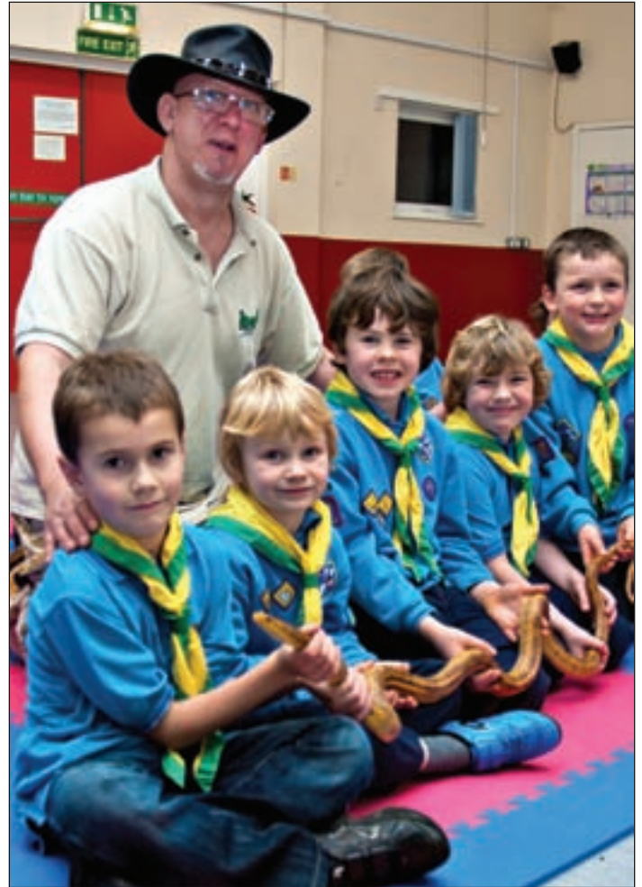
Some of the Beaver Scouts with creepy crawlies

Anyone interested in joining the Beavers should contact Alicia at Alicia@hunterhealey.co.uk or call 07952 727232.