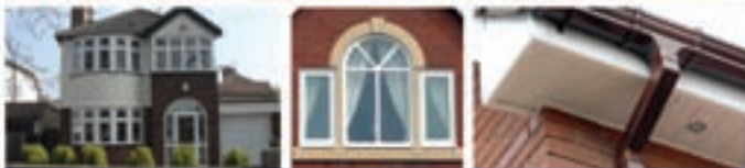
Also a full range of windows and doors

Voted North West Conservatory & Windows Installer of the year 2008