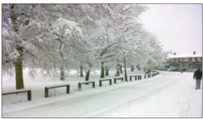
Lodge Drive