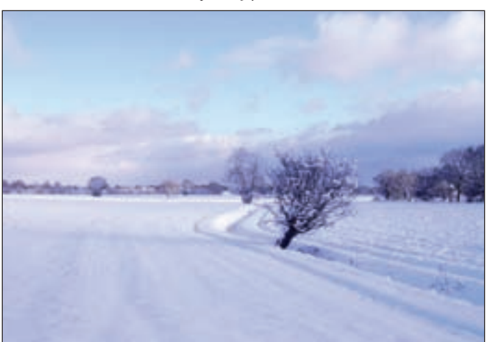
The Culcheth countryside