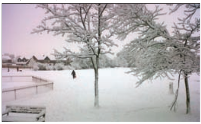
The village green

and dangerous road surfaces due to inadequate gritting. Special thanks to Culcheth Life readers Paul Campbell and Chris Vobe for submitting their photos. Many more are displayed on the www.warrington-worldwide.co.uk website.