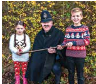
Arresting times for Victorian Policeman