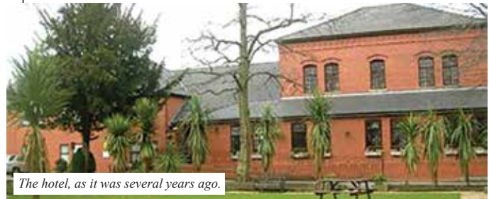
The hotel, as it was several years ago.

There are also objections on the grounds of traffic problems, loss of trees, and impact on the openness of the Green Belt. Planning officers recommended the scheme be approved, however. They said the new development would have 292 sq metres less floor area than the existing hotel and would be restricted to parts of the site already developed, so would have no greater impact on the Green Belt than the hotel.