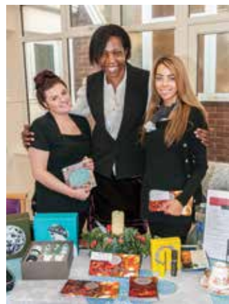
The team from Spa Beautiful

More pictures online at www.culchethlife.com