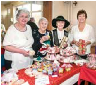
Stallholders at Culcheth Methodist