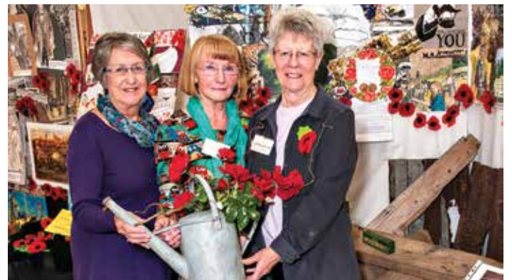
Culcheth Art Group and their WW1 display