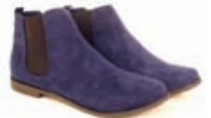
LOIS CHELSEA BOOTS 25.00

GET 25% OFF YOUR ORDER ENTER CODE CULCETH25 AT THE CHECKOUT...EASY!