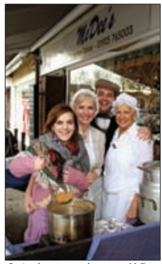
Recipe for success - the team at McDees