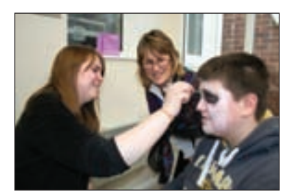
Face\ painting\ on\ the\ Methodist\ Youth\ Club\ stall