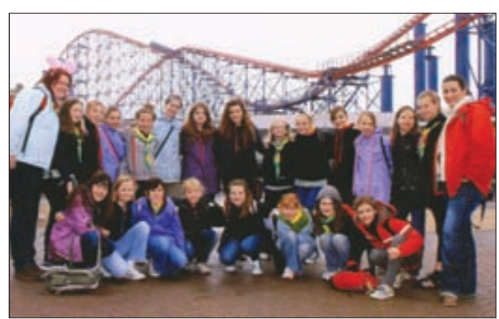
A grand day out in Blackpool

More than 9,000 Rainbows, Brownies, Guides and Senior Section members from across North West enjoyed the day. They enjoyed rides, an ice show and a world record attempt for the most people doing the "Cha Cha Slide" at the same time.