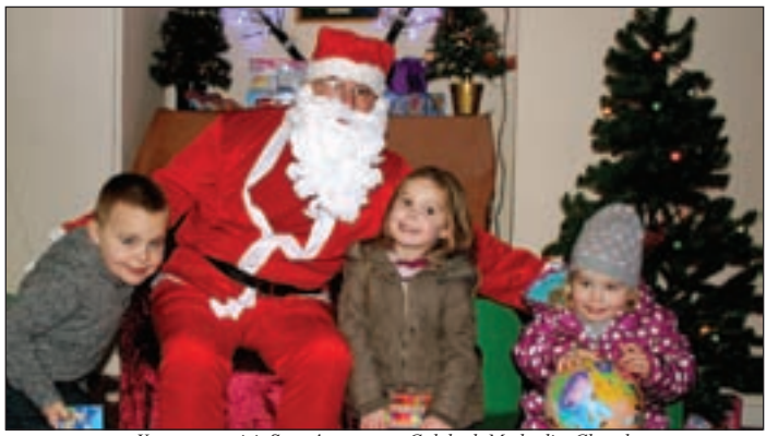
Youngsters visit Santa's grotto at Culcheth Methodist Church