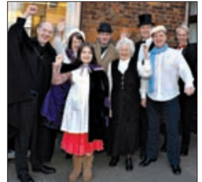
Newchurch Parish Hall management committee in their Victorian Day attire.