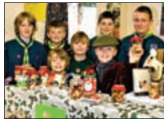
19th Warrington Culcheth Scouts with their Tombola Stall at Culcheth Methodist Church.