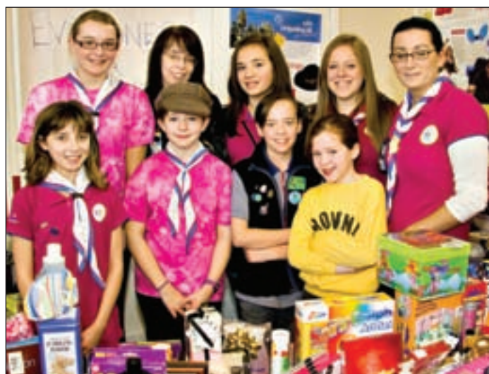
Culcheth Guides Brownies and Rainbows joined forces to run a Tombola at Culcheth Methodist Church.