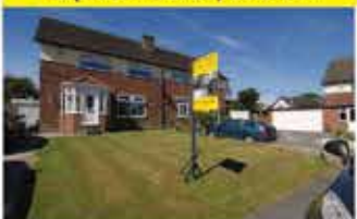
Sephton Avenue, Culcheth

Three bed semi detached, open plan lounge diner, conservatory, generous rear garden, detached garage, driveway parking.