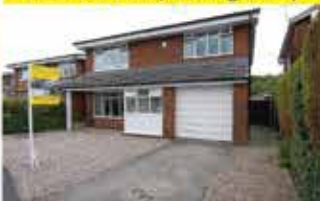
Cadshaw Close, Locking Stumps

Detached four bed property, lounge, open plan kitchen diner, conservatory, private rear garden, driveway parking.