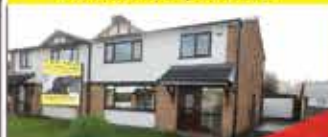
Howard Road, Culcheth

We provide a fresh approach to selling houses.