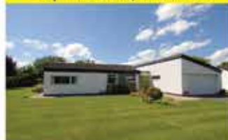
Hapsford Close, Birchwood

Detached bungalow, four bedrooms, three reception rooms, breakfast kitchen, family bathroom and ensuite facilities. Views over Birchwood golf course.