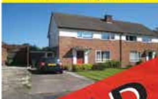
Beechmill Drive, Culcheth