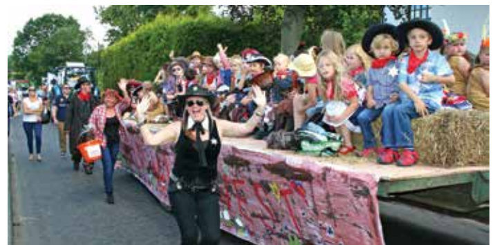
Croft Primary School's award winning float from the Wild West