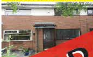
Fisherfield Drive, Birchwood