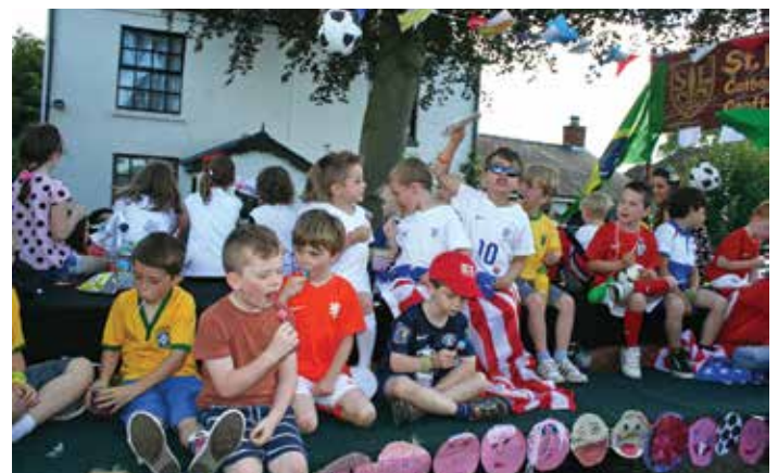
St Lewis' World Cup theme float