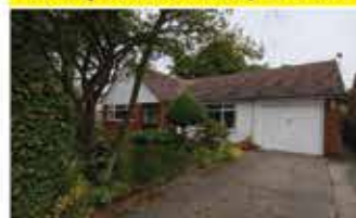
Fowley Common Lane, Culcheth

Detached dormer bungalow, five bedrooms, three reception rooms, shower room and family bathroom, extensive plot, not overlooked.