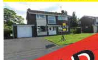
Clifton Avenue, Culcheth