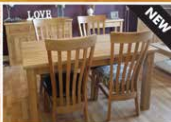
Clevedon Oak Dining & Occasional