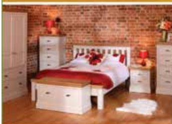
Tatton Painted Bedroom with Oak Tops