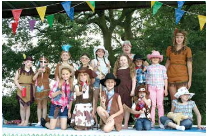
Croft Brownies wild west float