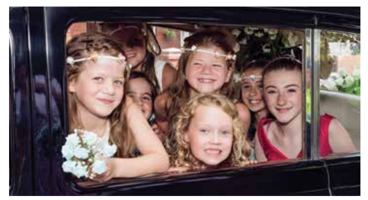
The retinues enjoying a ride to church