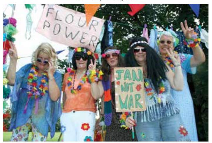
Flower power from Croft WI