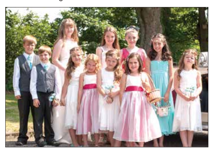
Incoming queen and retiring queen with their retinues