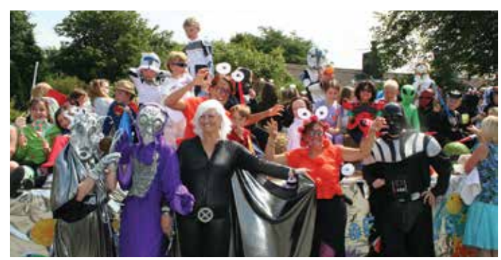
Alien invaders from Croft Primary School