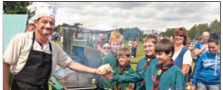
20th Warrington 1st Glazebury Scouts Barbecue kept the scouts and crowds fed