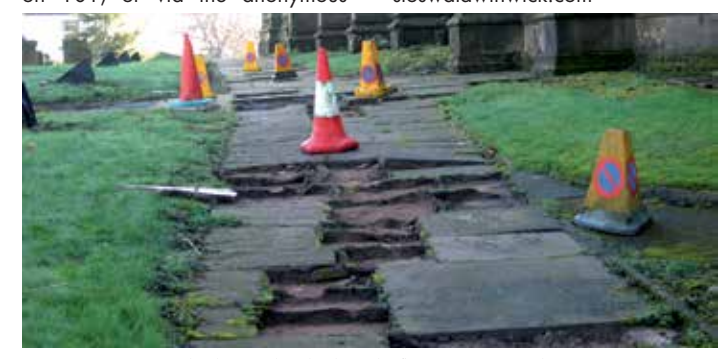
The damaged path where the flagstones were stolen.

Church can be made on line via the church website www. stoswaldwinwick.com