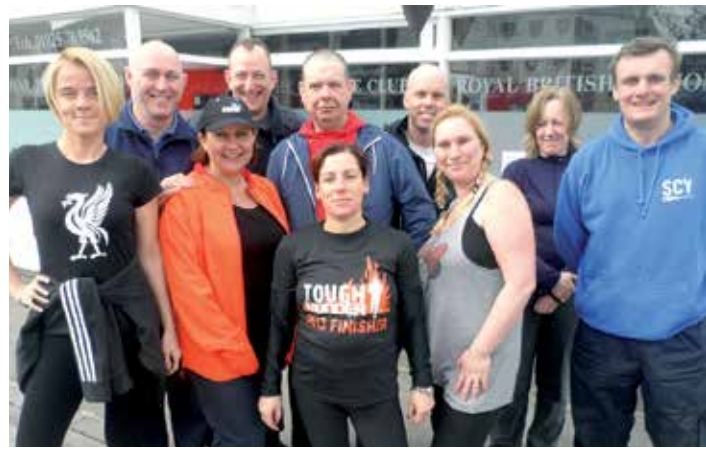
Members of the team are pictured outside Culcheth Royal British Legion after one of their training exercises.

The route they will be taking can be seen at http://goo.gl/maps/ rEMXs