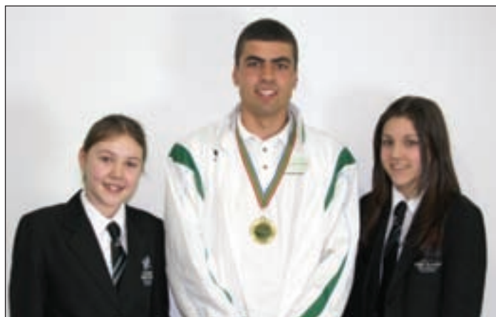
Wearing his African Champion's medal with pupils at Culcheth High School