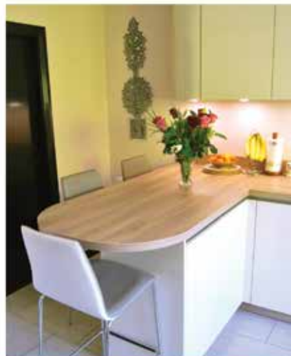
A FRESH NEW LOOK