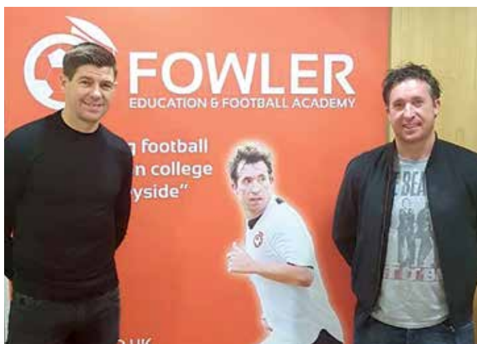
Steven Gerrard and Robbie Fowler.

First Trial - Wednesday 25th April 5pm - 7pm at Orford Jubilee 3G Pitch.