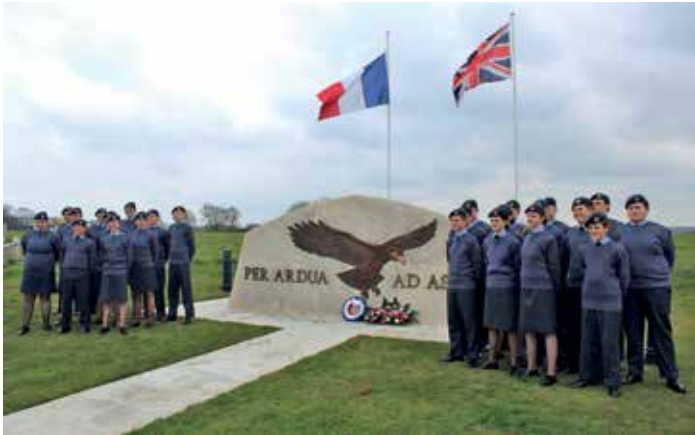
MEMBERS OF 2137 (Lymm) Squadron, RAF Air Cadets travelled to France and Belgium to visit World War 1 battlefield sites and cemeteries.

The expedition was to commemorate the foundation of the Royal Air Force in 1918.