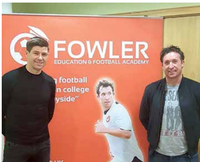
Steven Gerrard and Robbie Fowler.

Taster Evening Wednesday 25th April 5pm - 7pm at Orford Jubilee Hub