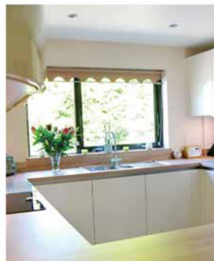
A FRESH NEW LOOK