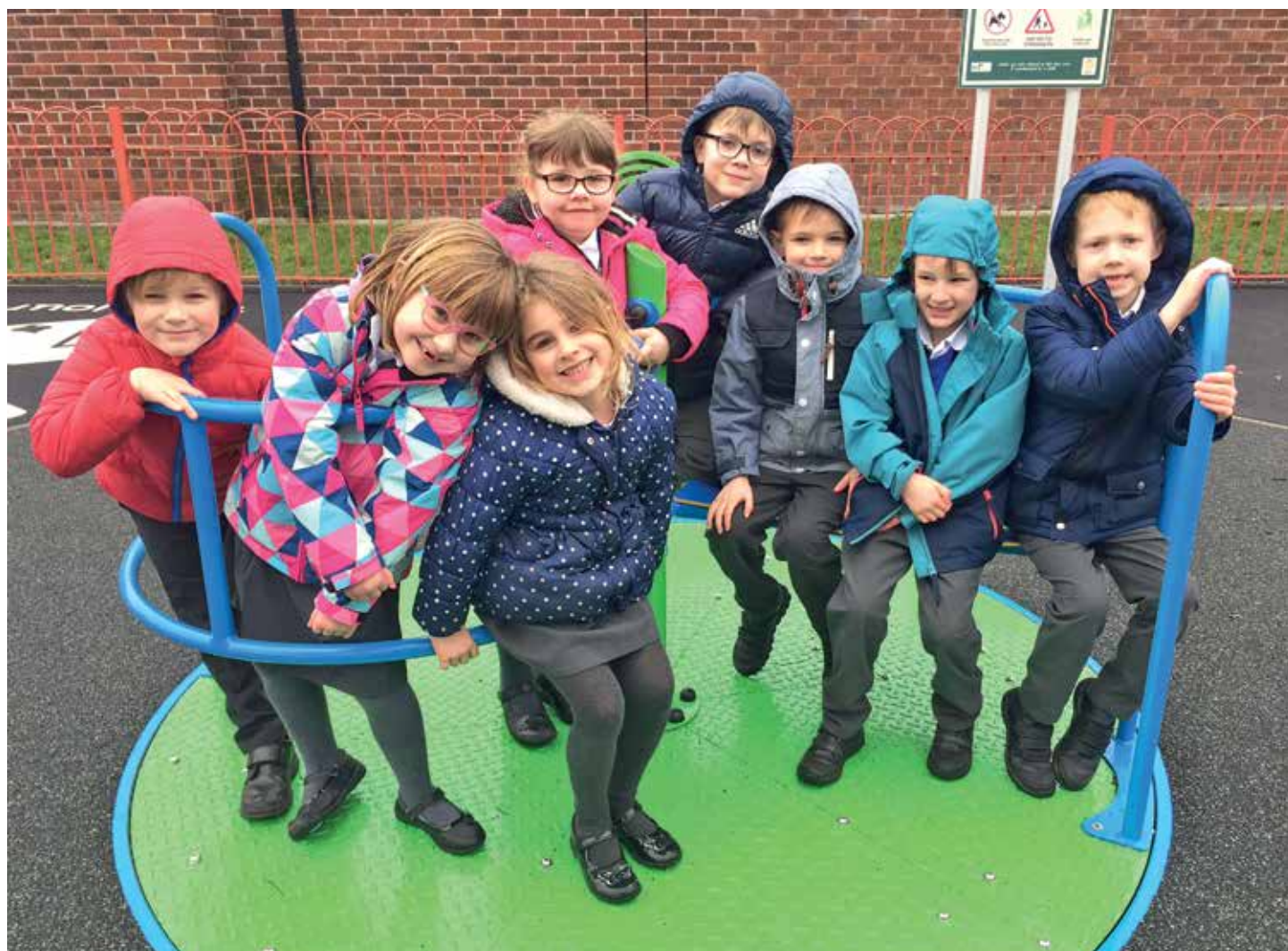
■ Year 1 Pupils at St Thomas CE Primary School, Stockton Heath, enjoy the new play equipment.