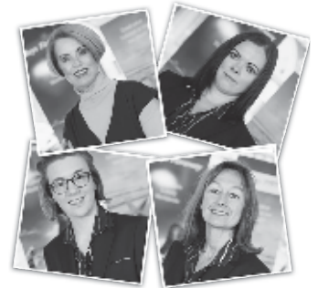
■ Stockton Heath Hays Travel Team.

Get in touch today; call, send an email, drop in to see us to obtain your quote and follow us on Facebook.