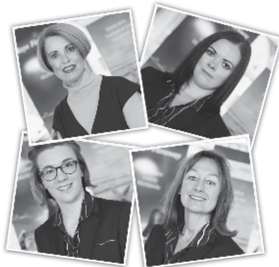
■ Stockton Heath Hays Travel Team.

Get in touch today; call, send an email, drop in to see us to obtain your quote and follow us on Facebook.