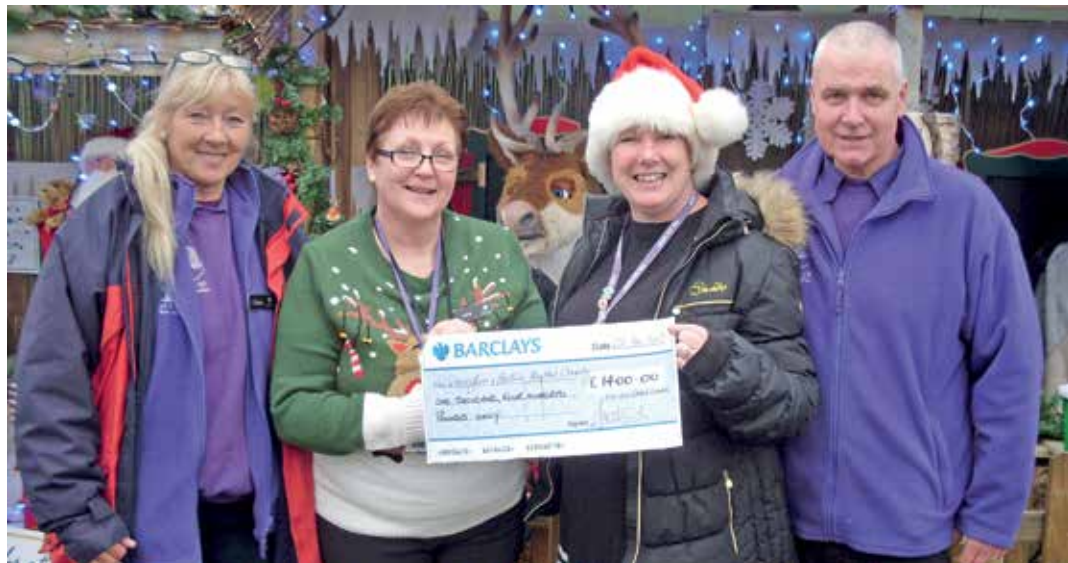
High Legh Garden Centre's incredible singing reindeer and donkey managed to raise more than a smile over the Christmas period.

The Garden Centre's generous customers kindly donated £1400 in the reindeer collection bucket for Warrington and Halton Hospitals NHS Foundation Trust (Intensive Care Unit).