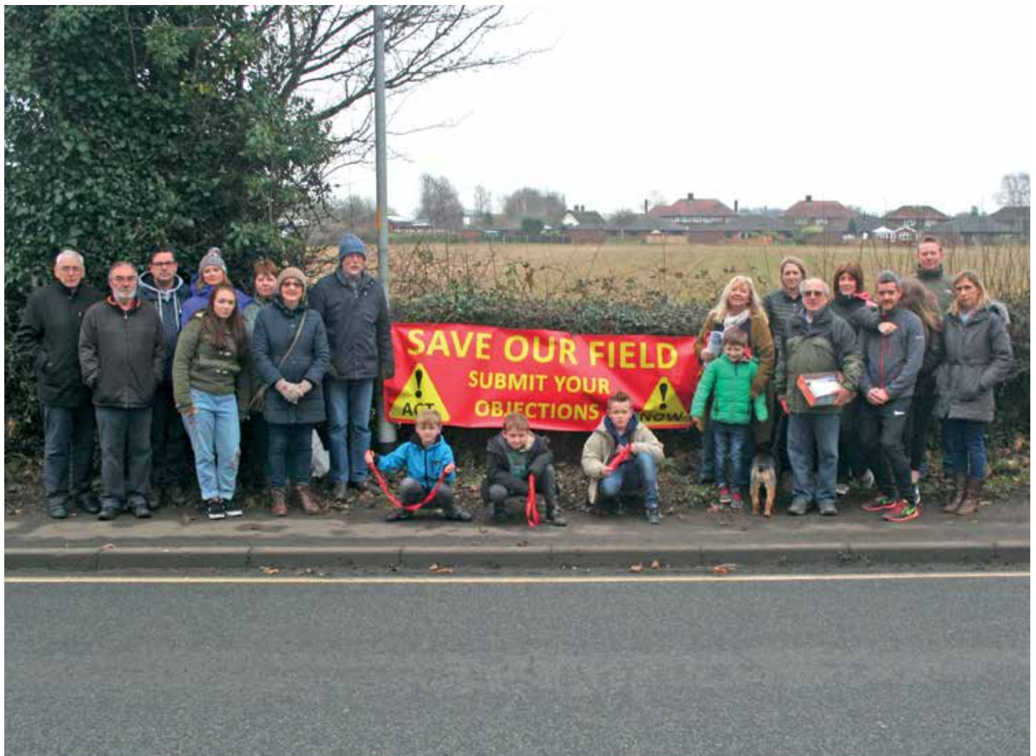
■ Residents rally to oppose the latest planning application.