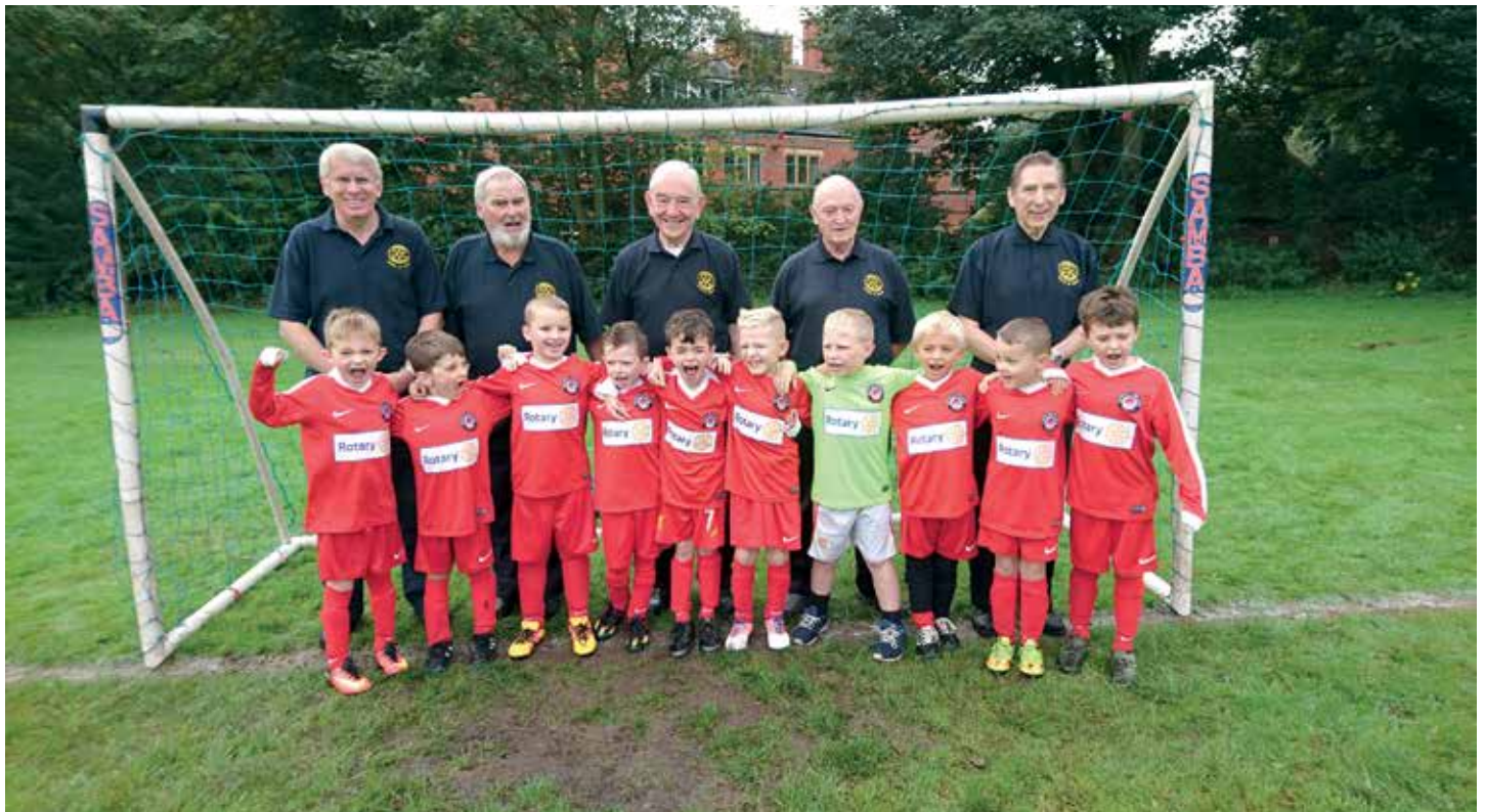
Winwick Athletic junior football team in kit provided by the Rotary Club.