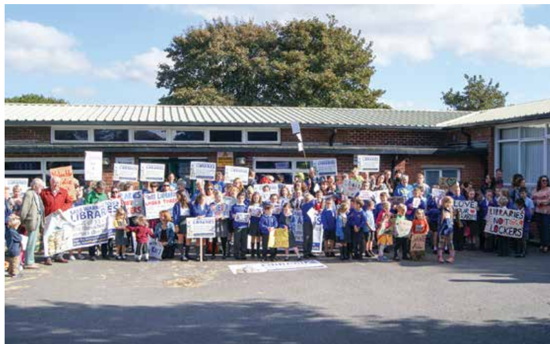
Protestors campaigning to keep the library open

Stockton Heath Parish Council has agreed to move its headquarters to the library from the Sandy Lane Centre, which can then be made