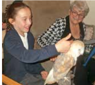
A pupil from Culcheth Primary School strokes the barn owl.