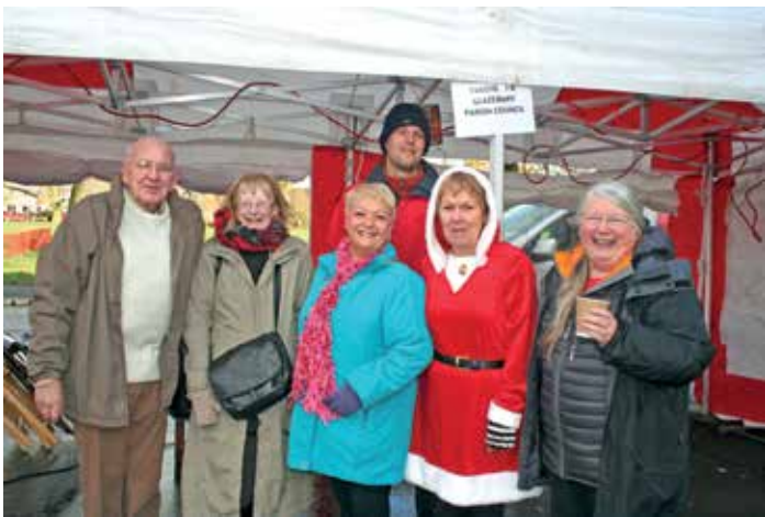
The Parish council team.