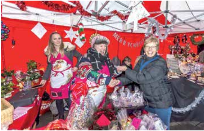
The Prize winning stall.