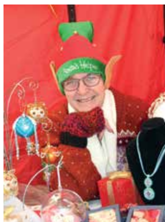
Elf Cath from Diamond Designs.