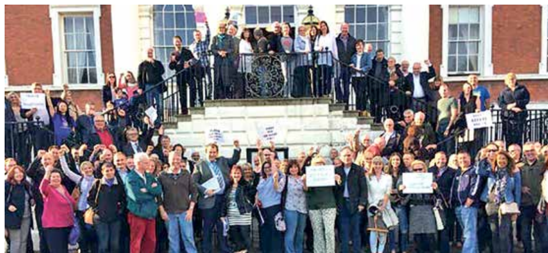
■ Protestors at a previous planning committee meeting.