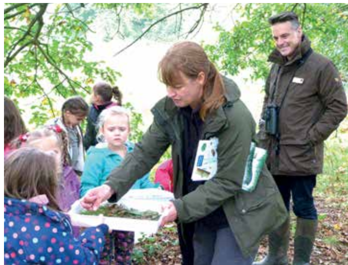
■ Hunting for mini-beasts at Moore Nature Reserve.

The Trust is urging people to write to their MP expressing their concerns, even though the public consultation period has closed.