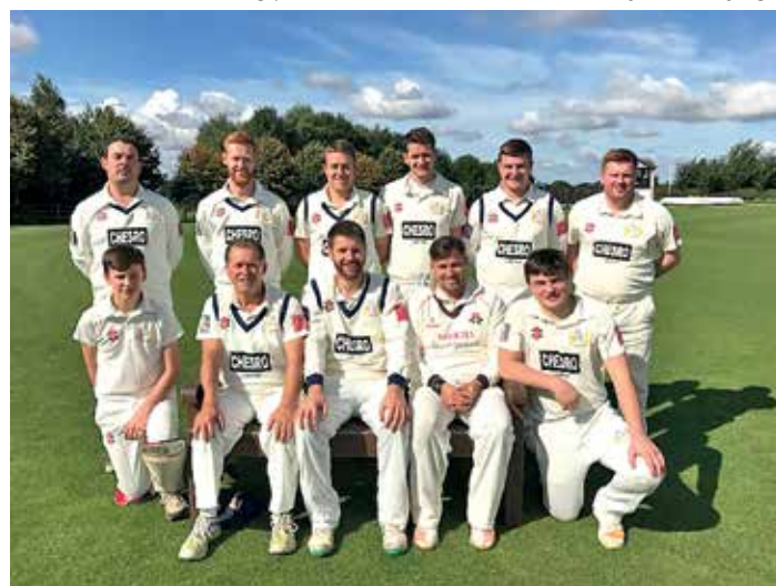
■ The newly promoted 2nd XI.

As reported last month, the club also won the league's Over 40s Cup – after more than 10 years of trying!