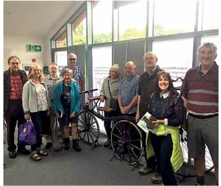
A group of ten Manchester based retired teachers; just one of the many groups visiting the centre over the past three months.

The whole project is supported by The Heritage Lottery Fund. To find out more, including opening hours and the opportunities for involvement and becoming a friend of the Centre, visit the website www.lymmhlc.co.uk