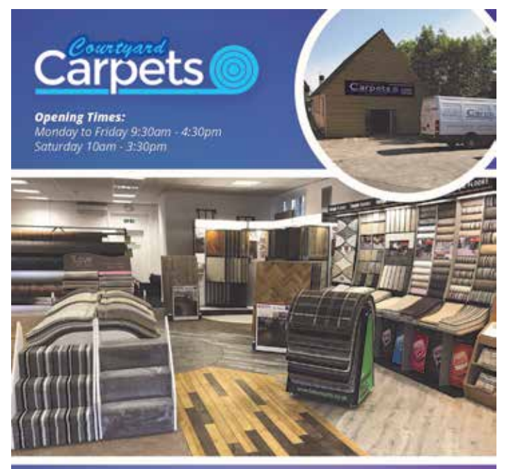
Call in store to find your perfect flooring solution. Carpets, Vinyls, Karndean, Laminates, Screeding, Rugs

1st for Service 1st for Quality 1st for Choice