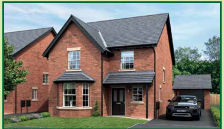
House type B