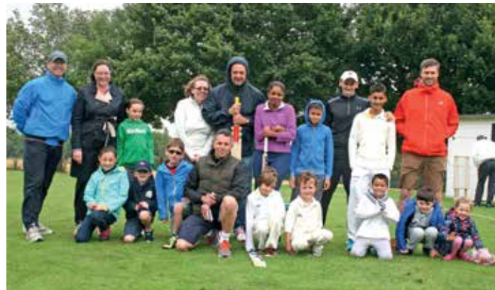
Hardy souls who took part in the parents and kids match

But there were no sour grapes on Lymm's part as it was a good game, played in a fine spirit.