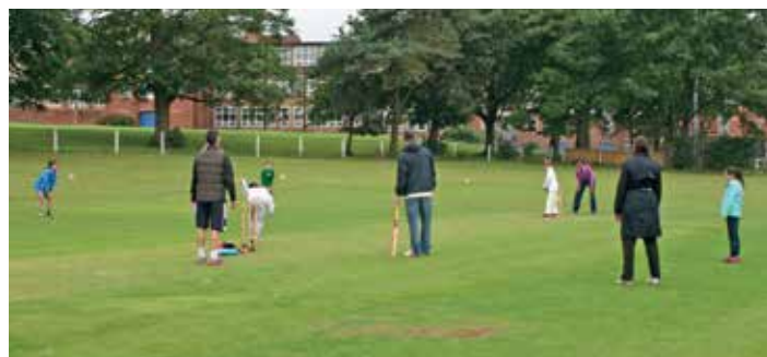
The kids and parents match in progress in the rain.