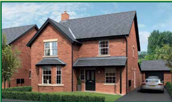
House type A