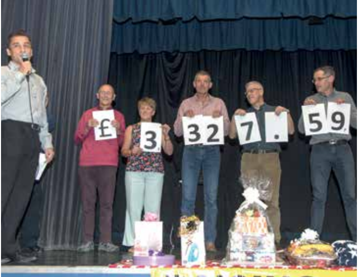
The Wheelers announce the money raised.

raised £300 via a sponsored walk along the Sandstone Trail and had donated it for buying a PA system for the club."