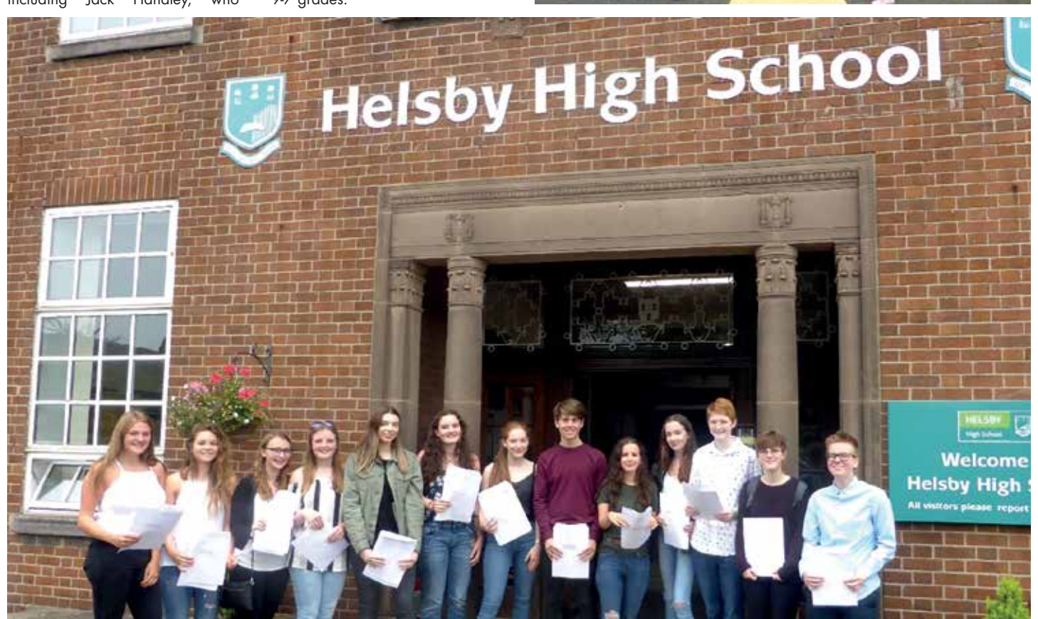
Some of the top performing Helsby High School Students