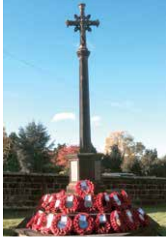
The poppy cascade displayed at Frodsham Health Centre last year and the war memorial at St Laurence Parish Church.