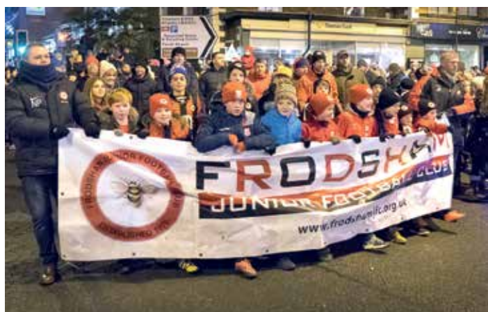
Scenes from last year's Christmas Festival.