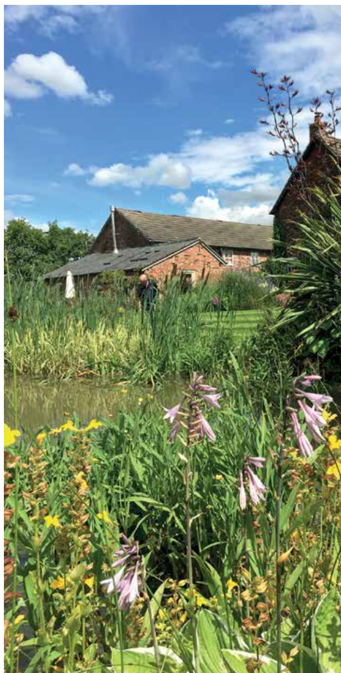
The gardens at Dingle Farm