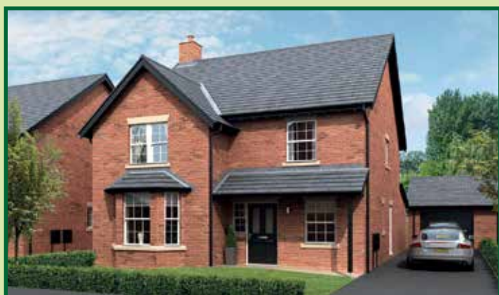
House type A