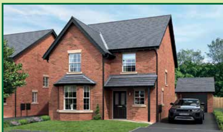
House type B