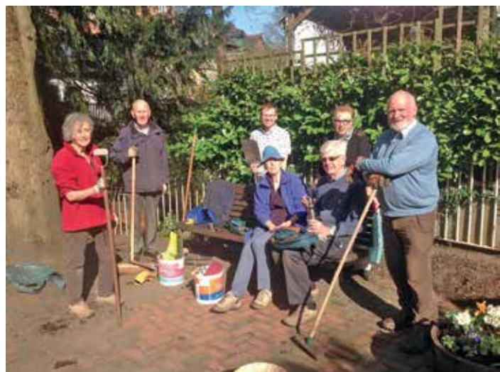
Volunteers in the sunken garden.