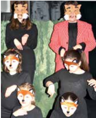
A scene from Fantastic Mr Fox