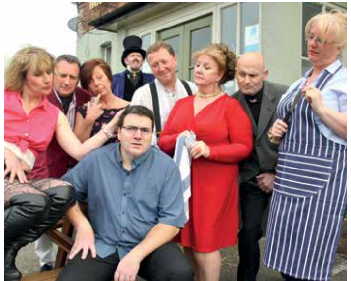
Cast of The Grand Gesture