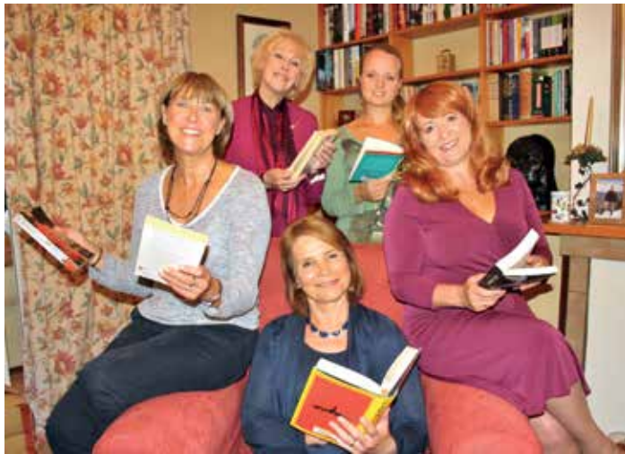
Cast of Some of My Best Friends are Women