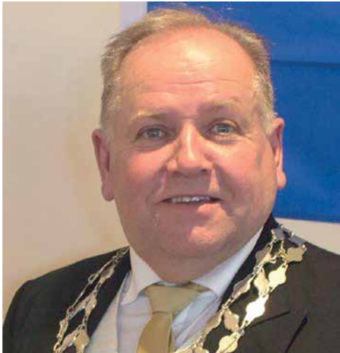
Former Mayor Mallie Poulton.