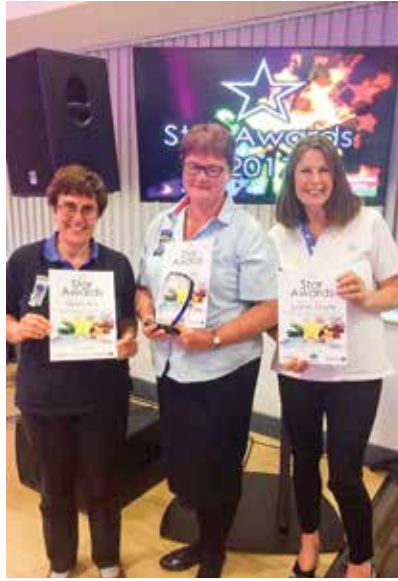
The Culcheth District team.

Anyone who would like to be involved in helping shape girls lives in your local community then please contact GirlguidingCulchethDistrict@hotmail.com or register your interest here: www.girlguiding.org.uk/interested