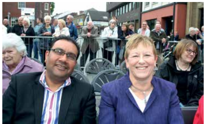
Warrington's MPs Faisal Rashid and Helen Jones