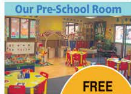
Our Pre-School Room