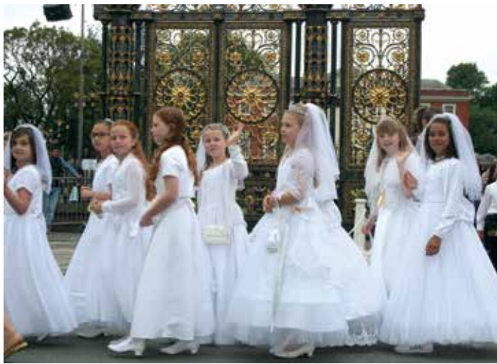
Local youngsters dressed to impress