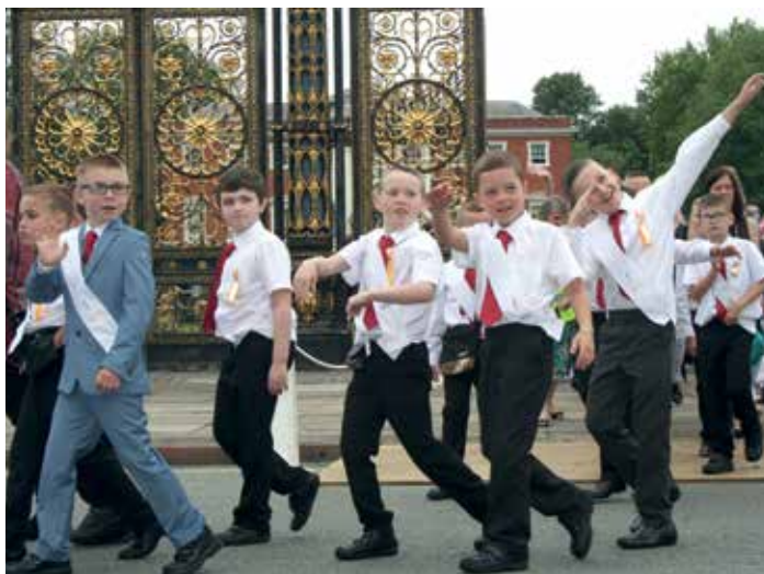
Local youngsters waving to the Mayor