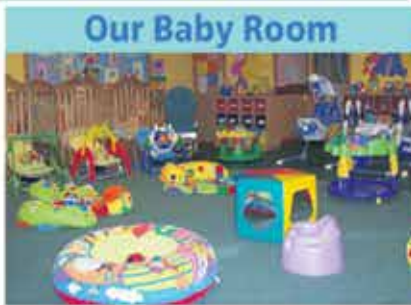
Our Baby Room