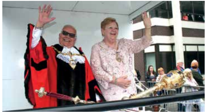
The Mayor & Mayoress take the salute

Despite overcast skies the rain held off for the procession.