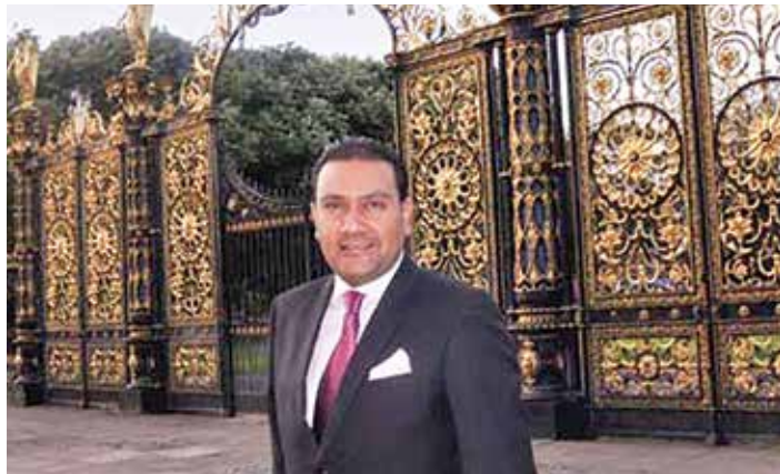
WARRINGTON South's new MP Faisal Rashid has taken up residents concerns over proposals to build up to 1,000 new homes at Grappenhall Heys and Appleton.

He has written to members of the Council's Development Management Committee reflecting concerns that have been raised about two planning applications in Appleton and Grappenhall Heys, which were deferred by the development control committee recently.