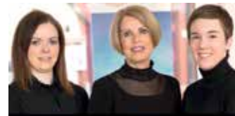
Stockton Heath @ Hays

The Castle of Santa Barbara is Alicante's main emblem; a glorious golden fortress standing 166 metres above sea level. Once you reach the very top, the breath-taking views of the marina are worth the climb. The Explanada de Espana is a maritime