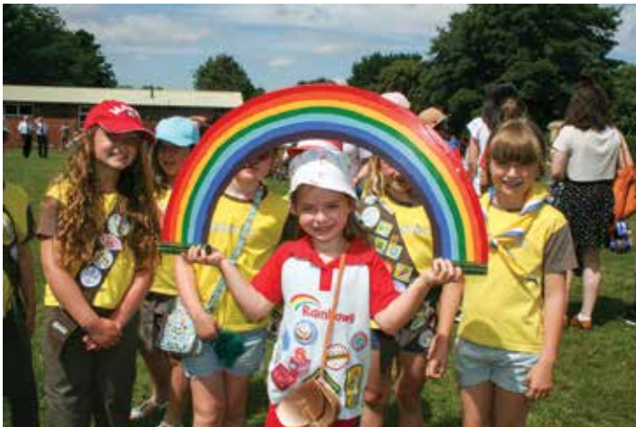
StocktonHeath Rainbows and Brownies.

More pictures and highlights of the live broadcast can be seen on warrington-worldwide.co.uk