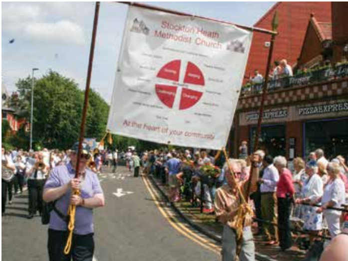
Stockton Heath Methodist Church.