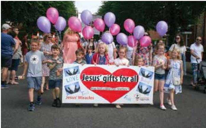
Youngsters walking in the annual Stockton heath Walking Day.