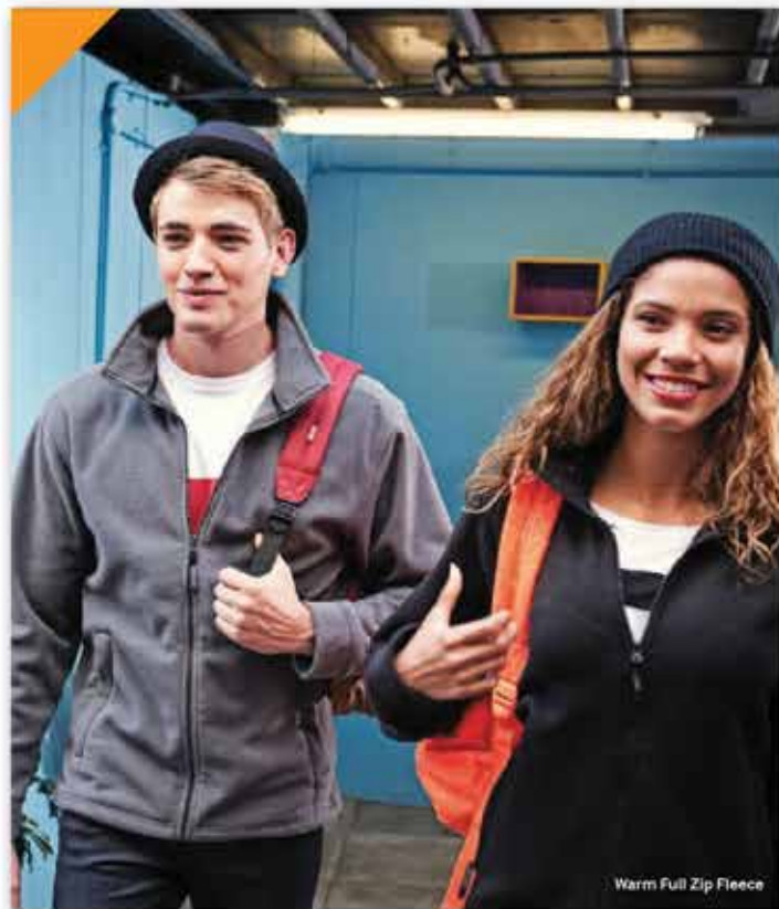
Warm Full Zip Fleece