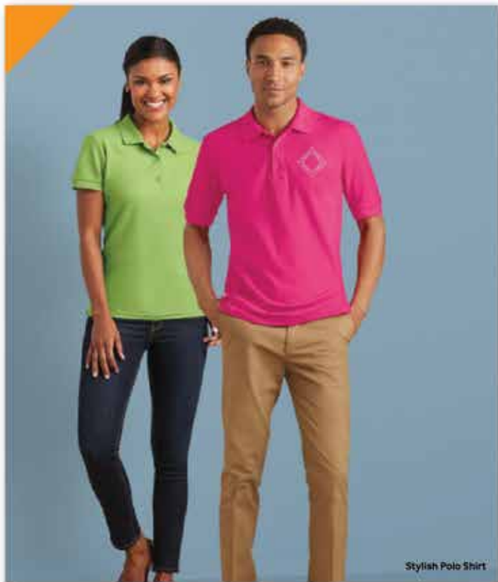
Stylish Polo Shirt

PERSONALISING WORKWEAR FOR OVER 40 YEARS QUALITY GUARANTEED