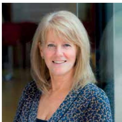
External Room Bookings Events / Sponsorship

wendy.parry@foundation4peace.org or events@foundation4peace.org Office No: 01925 581234