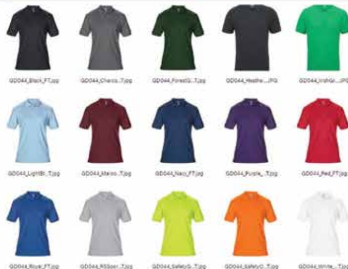
Choice of 15 colours