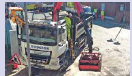
Amazing what can happen in 4 days!