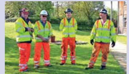
Half way there