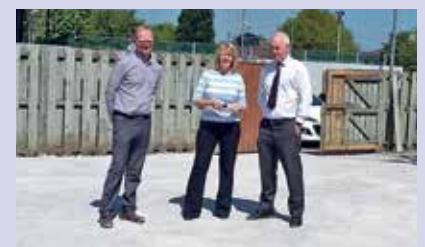
Thank you from everyone at the Peace Centre