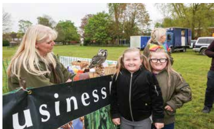
Wild Wings Birds of Prey.