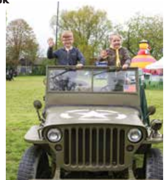
Youngsters check out a US Army jeep.

simple solutions Financial Management Ltd INVESTMENTS & PENSIONS